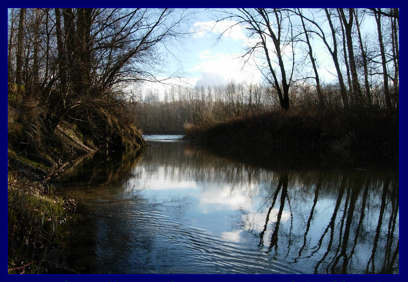
State Nature Conservancy of the Slovak Republic