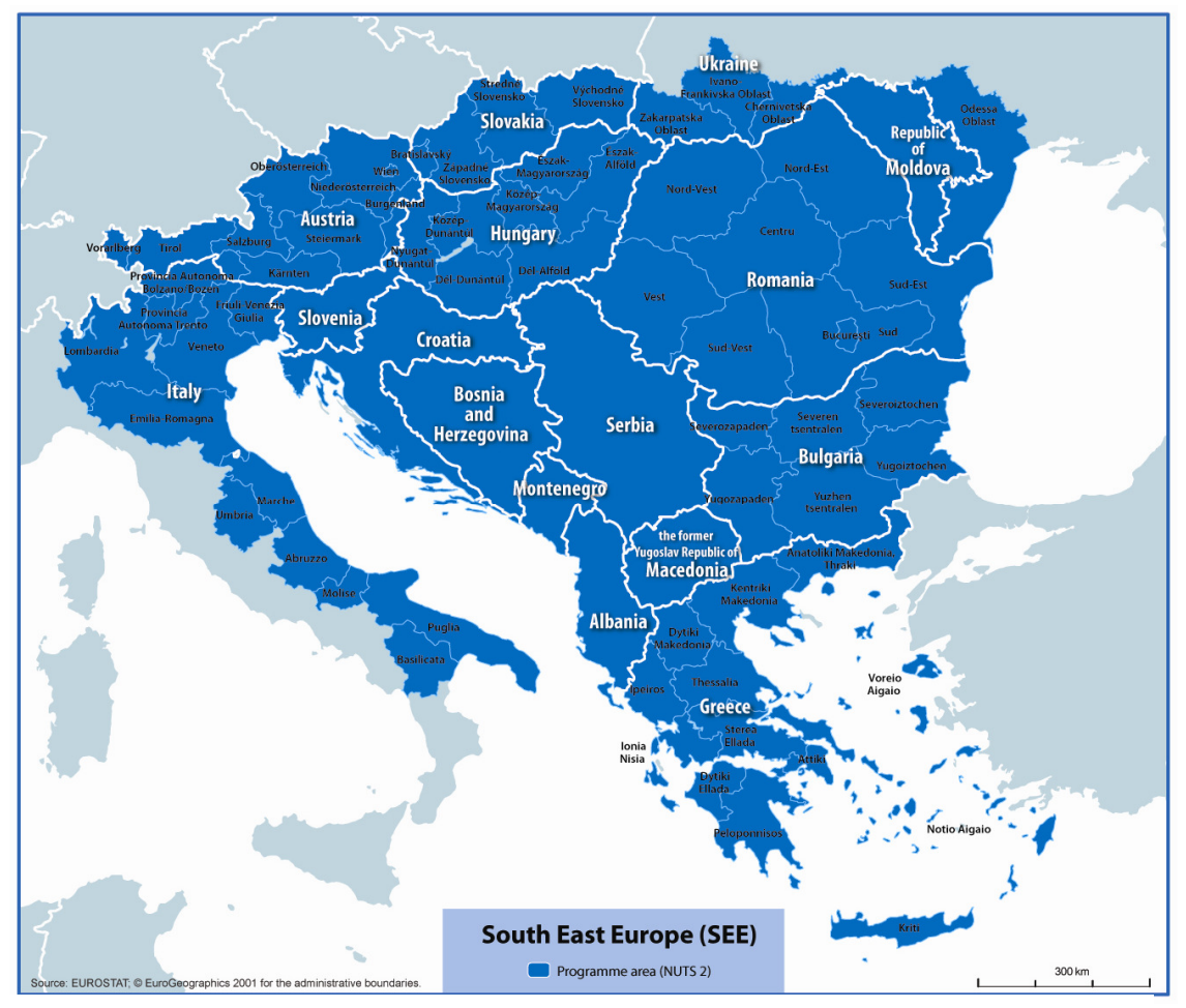
Figure 1 SEE eligible area

The SEE cooperation area is defined by the Commissions Decision of 31 October 2006/769/EC (see Fig. 1).